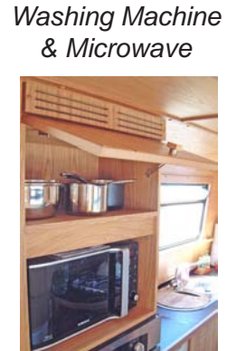
Washing Machine & Microwave

Emerald 58 ready to move onboard from under £94,000 inc VAT