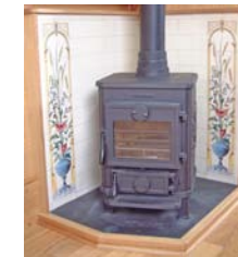
Central Heating and Solid Fuel Stove