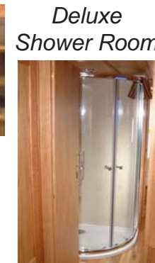
Deluxe Shower Room